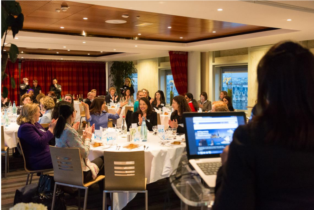
A lively dinner was enjoyed by all and provided an opportunity for more networking.