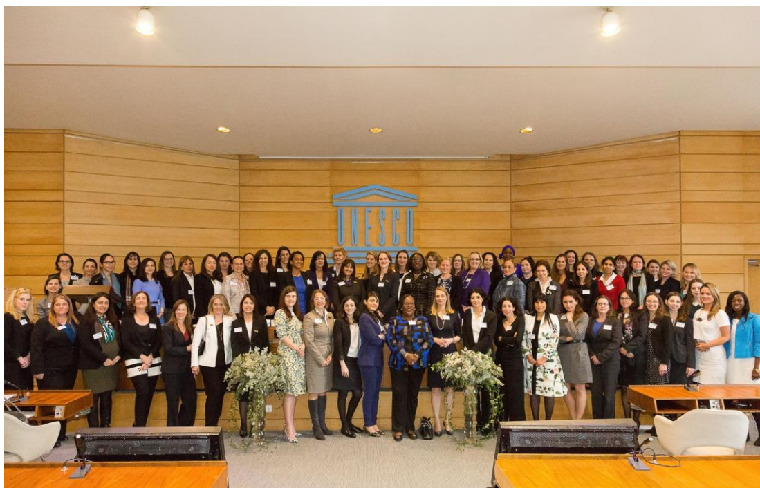
Panellists and delegates pose for a group photo at the end of the Sessions.