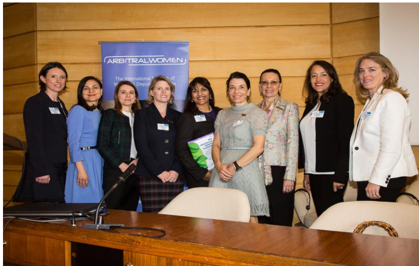
ArbitralWomen Board members present at the Conference