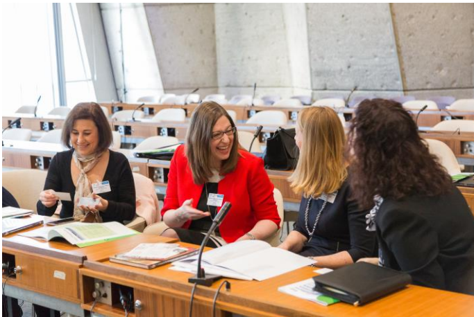
Delegates exchanging business cards.