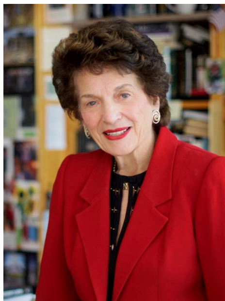
Judge Judith S. Kaye

It is with sadness and gratitude that I write these few words about Judge Kaye's life, a life impossible to capture on paper. I met Judge Kaye in connection with the creation of the New York International Arbitration Center. She was the driving force and made it possible. And she achieved that goal while making every one of us who worked with her feel her warmth and enjoy her humor. I offer here a short summary of her life and invite you to read the excerpts below from the article she wrote in 2012 for the New York State Bar Association Dispute Resolution Section entitled Déjà Vu: A Personal Reflection on Women in International Arbitration , reflecting on entering the world of international arbitration, which at that time had as few women as the law firm world had 50 years earlier.