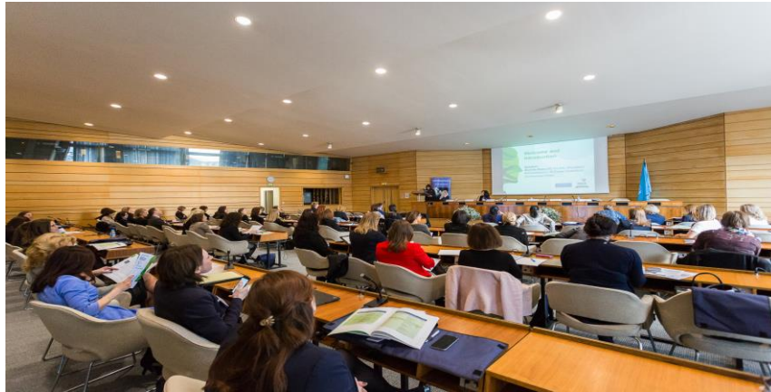
Opening of the Conference.

On behalf of both ArbitralWomen and the Chartered Institute of Arbitrators, thank you to all those who attended, participated in, or otherwise supported the recent ArbitralWomen/CIArb International Conference at UNESCO House in Paris.